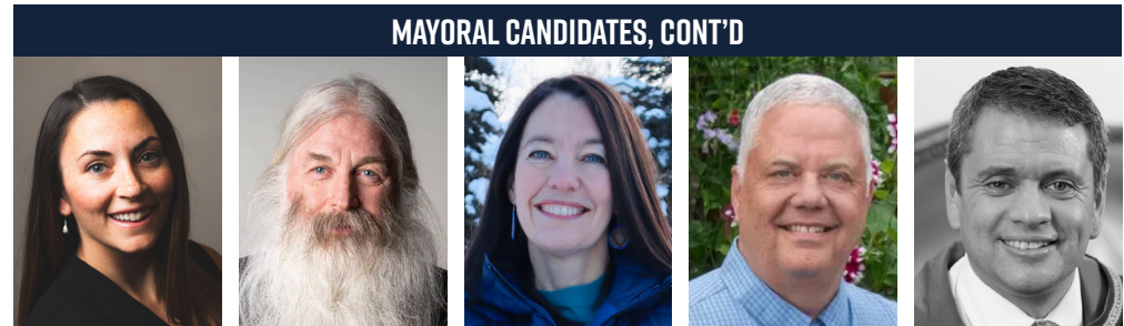
MAYORAL CANDIDATES, CONT'D